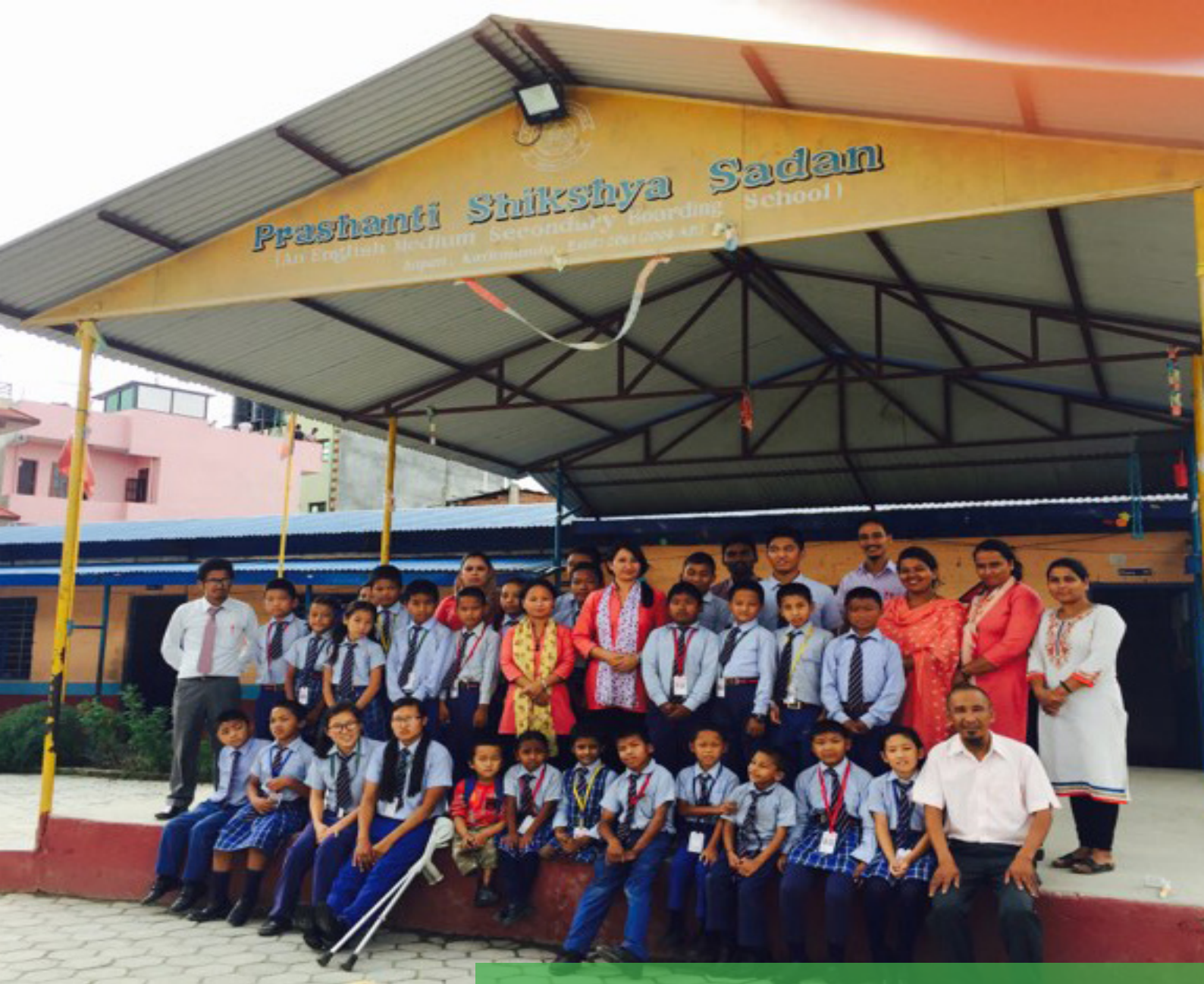
CDCA , Children having photo sesion with their respective teacher at prashanti academt school premises , kapan